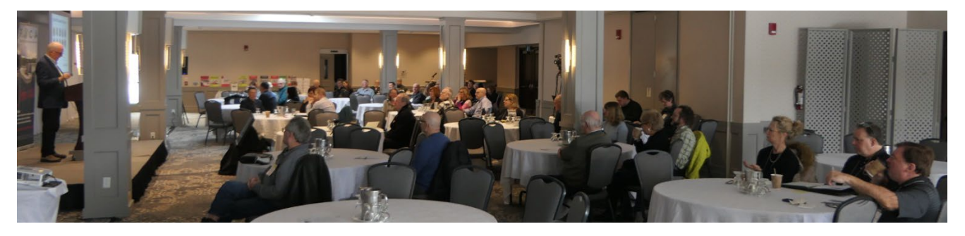
Thank you to everyone who joined us in-person and by webinar!